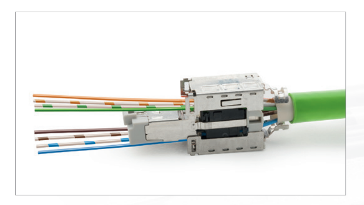
Step 3 Remove the separated wires... READY!

Close covers by pressing with a common tool or by thumb until it is locked together and wires are automatically cut off.